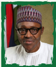
President Muhammadu Buhari, GCFR