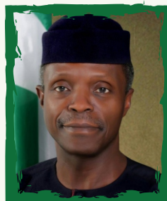
Vice President Yemi Osinbajo, SAN, GCON Chair, PEBEC

Background: On Thursday May 18, 2017, Nigeria's Acting President, His Excellency, Prof. Yemi Osinbajo SAN, signed an executive order on transparency and improving the business environment in Nigeria.